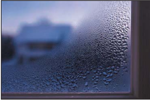
Condensation on the inside of a window-pane.

■ Keep indoor humidity low. If possible, keep indoor humidity below 60 percent (ideally between 30 and 50 percent) relative humidity. Relative humidity can be measured with a moisture or humidity meter, a small, inexpensive ($10-$50) instrument available at many hardware stores.