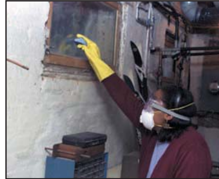
Cleaning while wearing N-95 respirator, gloves, and goggles.

■ Wear goggles. Goggles that do not have ventilation holes are recommended. Avoid getting mold or mold spores in your eyes.